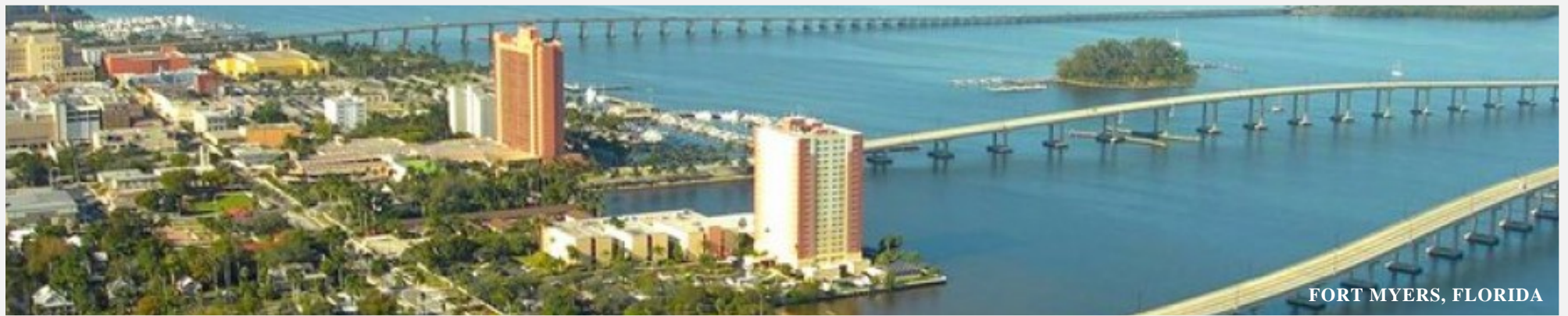
FORT MYERS, FLORIDA